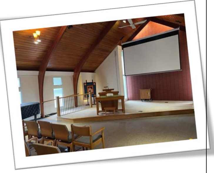
The new stage was installed in 2023, which provides better access via the ramp and a single level for a variety of stage configurations.